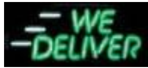
WE DELIVER IN1603

16" X 32" Blue, Yellow, Red; Neon Wall/Window; P/N: IN1602