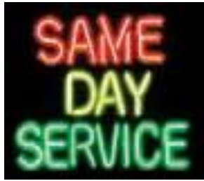
SAME DAY SERVICE IN2402

24"X 24" Red: Neon Wall/Window; P/N:IN2401