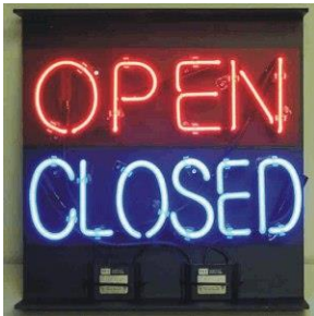
5" OPEN/CLOSED IN1818

24"X 24" Red, Green, Yellow; Neon Wall/Window; P/N:IN2409