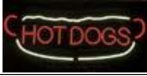
HOT DOGS IN1622

16" X 32" Red/Blue; Neon Wall/Window; P/N:IN1620