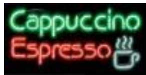
CAPPUCCINO /ESPRESSO IN1604

16" X 32" Green/White; Neon Wall/Window; P/N:IN1603