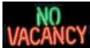
NO VACANCY IN1608

16" X 32" Red/White; Neon Wall/Window; P/N: IN1607