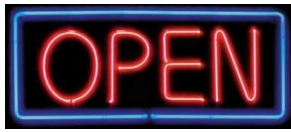
OPEN W/BORDER IN1613

16" X 32" Red, Yellow, Green; Neon Wall/Window; P/N:IN1612