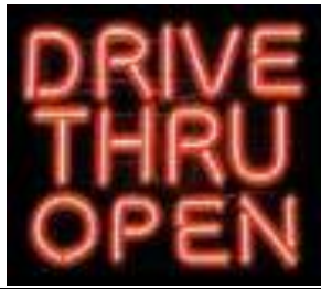
DRIVE THRU OPEN IN2401

24"X 24" Red: Neon Wall/Window; P/N:IN2401