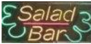
SALAD BAR IN1625

16" X 32" Green/White; Neon Wall/Window; P/N:IN1624