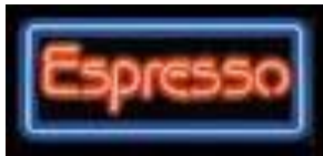
ESPRESSO W/BORDER IN1617

32" X 10" Red/Green; Neon Wall/Window; P/N:IN1614