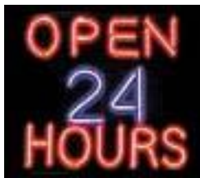
OPEN 24 HOURS IN2406

24"X 24" Red, Green, Yellow; Neon Wall/Window; P/N:IN2406