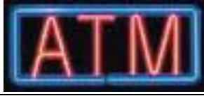
ATM W/BORDER IN1620

16" X 32" Red/Blue; Neon Wall/Window; P/N:IN1620