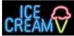
ICE CREAM IN1602

16" X 32" Red/Blue; Neon Wall/Window; P/N:IN1601