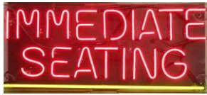
IMMEDIATE SEATING IN1629

16" x 32" Yellow, Green, Red; Neon Wall/Window; P/N:IN1625